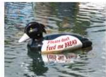
Duck with a message