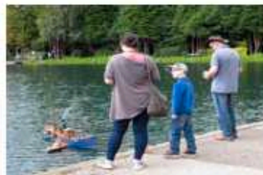
Three generations in control